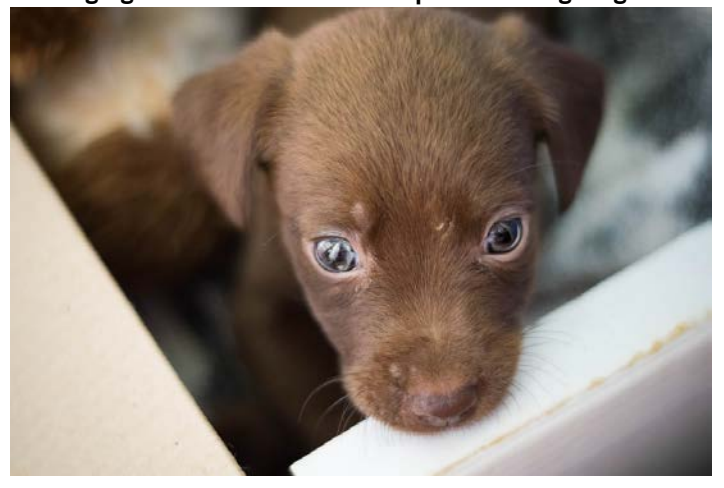
(YOU CAN SEE THE MARKS ON THE DOG'S FACE. THESE PROBABLY CAME FROM THE LIFE AND TORTURE HE HAD BEFORE BEING ADOPTED.)